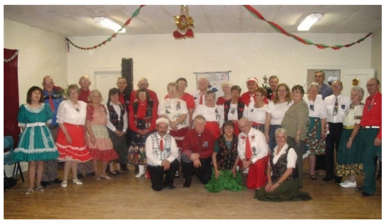
Fundy Squares Christmas 2006