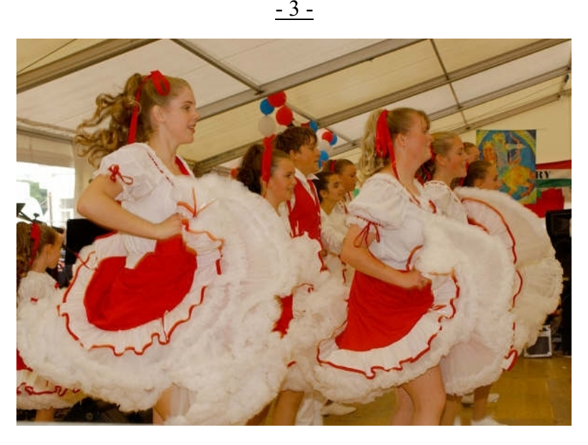
Marys Islanders at the International Bazaar